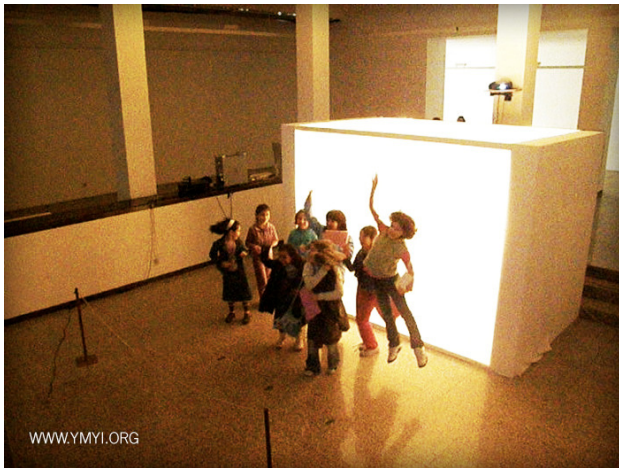
Fig. 4. Picture of users experiencing the YMYI artefact.

YMYI was setup on a conference room, shared with other conference activities. At the time of the performance, the computer running the software exhibited some latency to process the movements of the dancer, which were noticed and incorporated by the dancer in his performance. In his words: "My interaction with the machine resulted in a growing adjustment of both my sensitiveness and fine motor skills so that my body became more suitable to every movement to be projected onto the screens. The moving field for the image motion capture that I had at my disposal was a truly narrow space, which posed additional difficulties to my improvising dynamics and composition." He also reported that his interaction with the system posed him some challenges: the standard-slow motion capture of the sensor device compelled him to keep a low performance body speed and from that latency create an imaginative rhythm to keep an interest in both his displayed image and his movements. He stated that to take advantage of the system, he had to reinvent himself to develop thoroughly his whole composition.