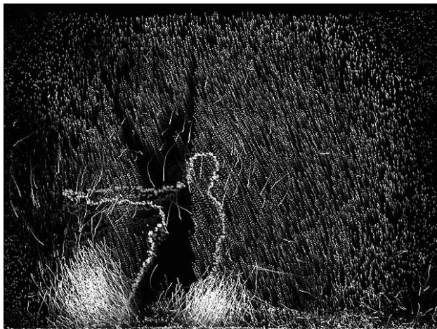
Fig. 1. The YMYI artefact.

YMYI motivation is to allow the performer to observe and give evidence to an artistic expressiveness developing in the mind an array of gesture ongoing instantiations. These physical expressive gestures are rendered in digital compositions formed by musical and visual movements, composing an enriched audio-visual experience.