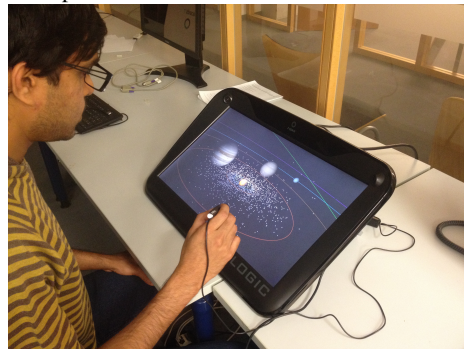
Figure 3: Figure 3: Our Solar System Demo on zSpace device.

Immersive virtual environments provide a more intuitive and natural interaction compared with conventional rendering of virtual environment. Therefore, we decided to stereo render our virtual environment on zSpace device (see Figure 3) in order to provide this immersion and also seeing objects in 3D is a natural and more intuitive way to understand spatial relationships. We also need to define and test new 3D interaction metaphors.