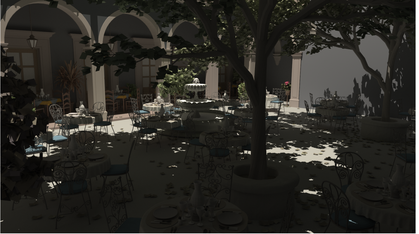
Figure 3: Path traced images of San Miguel using Embree.