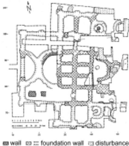
Figure 1: A map of the excavation site which served as basis for the reconstruction of the building.

construction must be considered to be speculative by nature. However, the degree of speculation varies. We can categorize the sources of data used to complete the reconstruction: