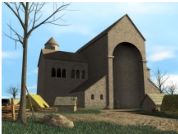
Figure 3: A photorealistic rendition of the building.

Photorealistic images like that depicted in Figure 3 allow a very intuitive understanding of what an ancient site looked like. Still images and animations resemble our every-day experience with photographs and television, while interactive virtual walkthroughs additionally provide the immediate experience of “being there” 3 . Undisputedly, a photorealistic rendition has a convincing visual power, but a great effort has to be made for the construction of such a model to make it look “right”, which often means making it look as realistic as a photograph. Every little detail has to be modeled, every surface has to be covered by an appropriate texture.