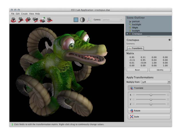
Figure 1: The editor of the course framework. This scene shows a model that has been exported from the game SPORE by Maxis using the COLLADA format. The matrix display is updated while using the widget in the transform panel.