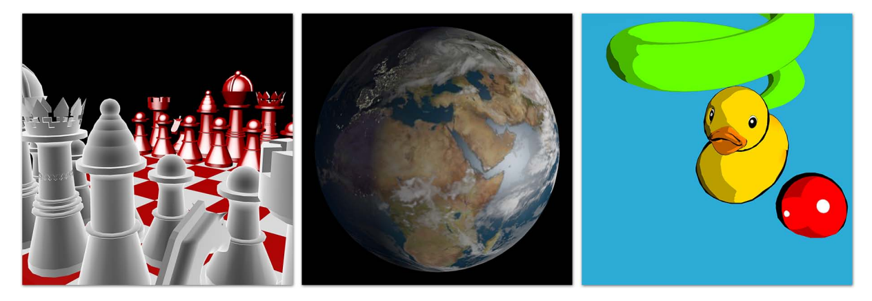
Figure 2: Entries submitted by students for the annual lab course competition. From left to right: A COLLADA-imported chess scene with custom shaders applied by Philipp Seeböck; Day-and-night shader implementation by Levin Pölser; Cel-shading by Sascha Wiplinger.

When graphics hardware became available as more affordable mainstream consumer products in the 1990s, most universities started to offer computer graphics courses in a computer science curriculum [Hit00]. At the same time graphics hardware APIs such as OpenGL became widely available. Users of such APIs didn't have to deal with low-level drawing routines anymore. Due to this development, several educators therefore proposed to replace the traditional syllabus of using raster-level algorithms with more practical approaches using higher-level APIs [Cun00, PG99].