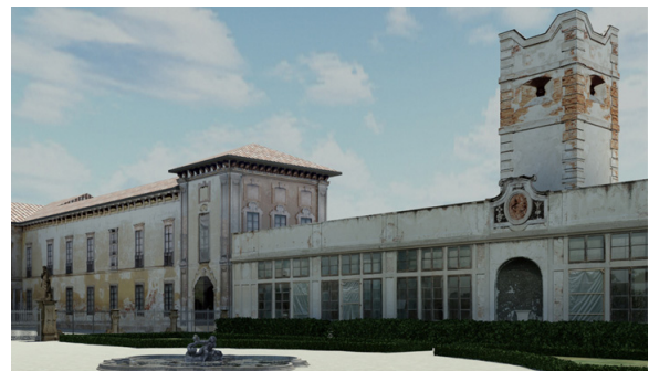
Figure 2: Textured model of the lemon grove

In the first case, navigation takes place by means of a normal web browser with appropriate plug-in and does not require particular hardware requisites; in the second case, on account of a greater immersive performance and additional functions there is also the need for a greater amount of hardware and the use of dedicated commercial software.