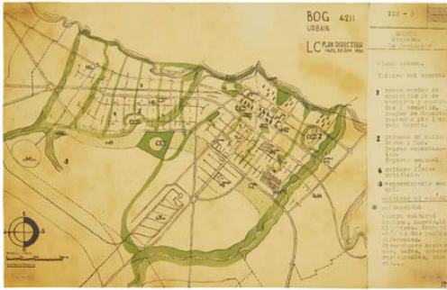
Figure 3: Urban map of Le Corbusier's plan [O'b10]

The interactive model was developed using Java, Jogl, and SVGAT an application to represent complex systems [Iba08]. The development was divided by two cycles, the first one was the modeling and the second one was the user interface design.