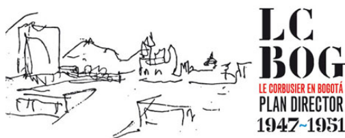
Figure 1: Exhibition brochure [O'b10]

Books [O'b10] were created as future reference of this exhibition. Figure 1 shows one of LeCorbusier's initial sketches, which is used as presentation of the exhibition.