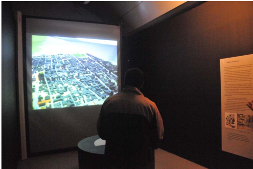
Figure 6: User interacting with the interface

to improve the models significantly because they know Le Corbusier Work really well and interaction adjust was made using experts knowledge.