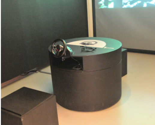
Figure 5: Mounting for the interactive model at "La casa de la moneda" Museum