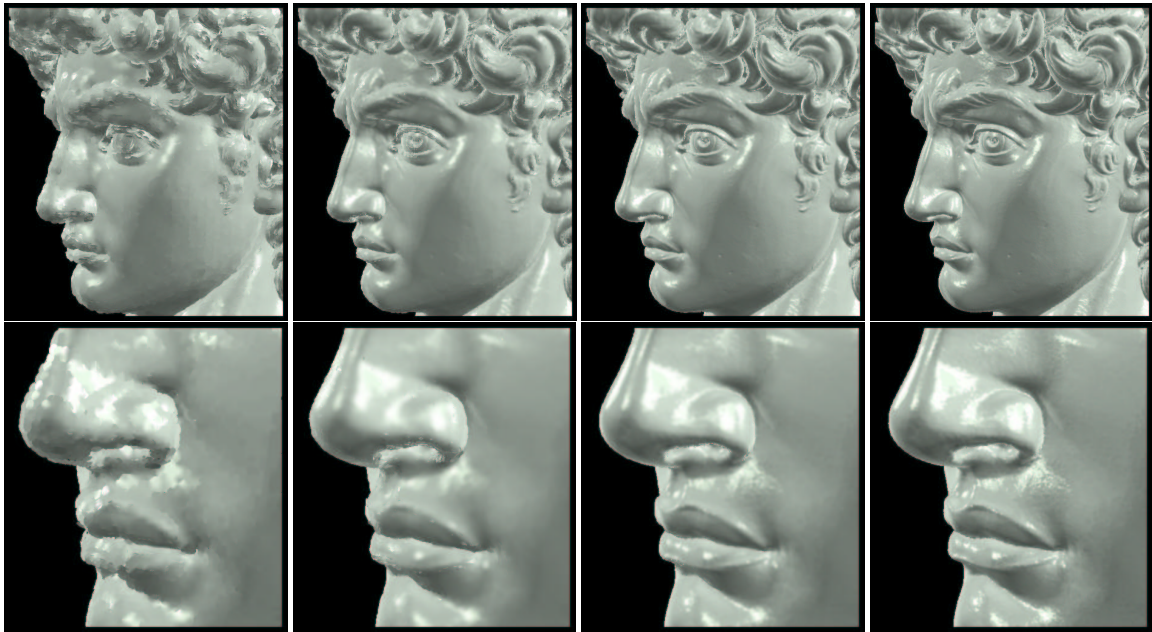
Figure 13: Progressive transmission of the David head model. From left to right we show snapshots with 5, 15, 50, and 100 percent of the data received. Reconstruction is done by breadth-first traversal. The bottom row shows close-up views of the top row.