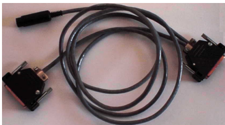
Figure 2: A parallel cable to genlock 2 machines. Beside the two DB25 connectors, we can distinguish a female mini-din 3 connector to plug the IR emitter of the shutter glasses.

Active stereo requires displaying alternatively the left eye and right eye images with shutter glasses masking the user's opposite eye. Image and shutter switching must occur before each video retrace: