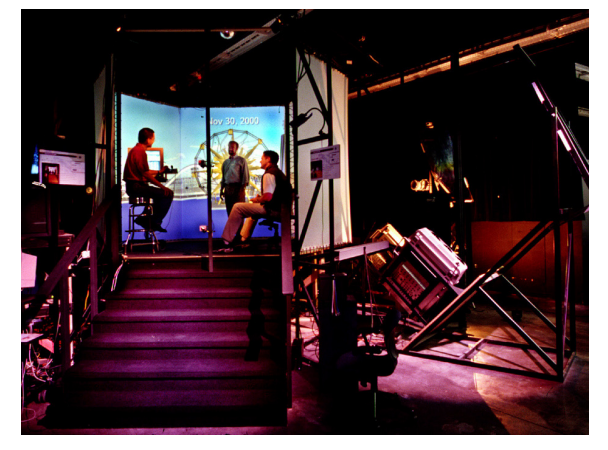
Figure 6 Exterior view of the Hercules IPT prototype