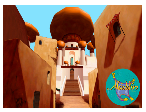
Figure 1 Aladdin's Magic Carpet Ride