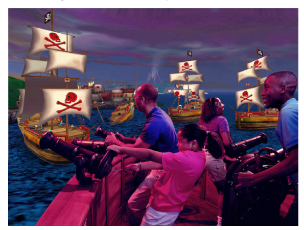
Figure 9 Pirates of the Caribbean: Battle for Buccaneer Gold