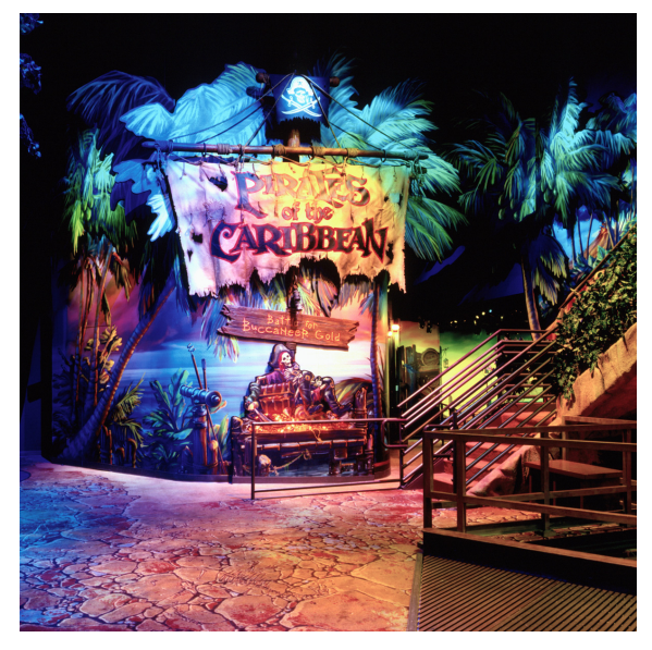
Figure 11 Entry to Pirates of the Caribbean queue line