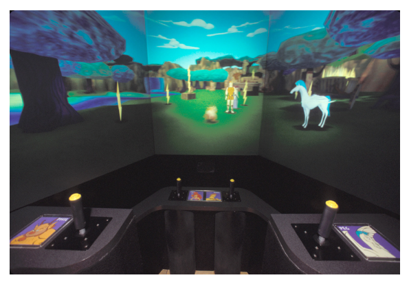
Figure 7 Interior view of the Hercules IPT