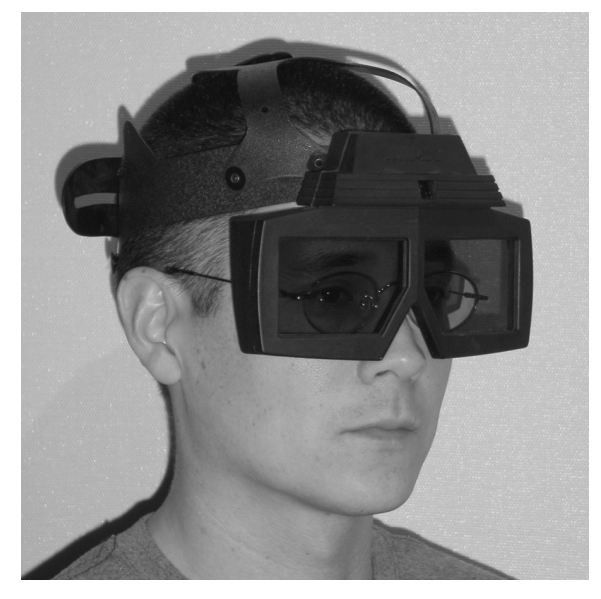
Figure 8 Stereo glasses used for the Hercules ride

Hercules takes place in a custom designed five-screen immersive projection theater (IPT). The theater is hexagonally shaped with screens only on five sides; the sixth is left open so guests can enter and exit the theater. To minimize the footprint of the theater and to maximize its angular resolution (for a given screen height) we turn the projectors on their side. This gives us an aspect ratio (screens taller than wide) that maximizes image quality and allows us to pack the theaters more closely together (figures 6 and 7).