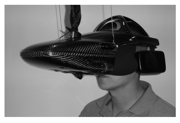
Figure 2 Aladdin head-mounted display

To provide adequate field-of-view and resolution we designed and developed our own head-mounted display. This was a CRT-based HMD with 640x480 resolution and an 80 degree horizontal FOV. Though the use of CRTs resulted in much higher image quality, the resulting form factor was extremely front heavy and required a weight relief system. Figure 2 shows an image of the Aladdin HMD. Figure 3 presents an HMD schematic diagram.