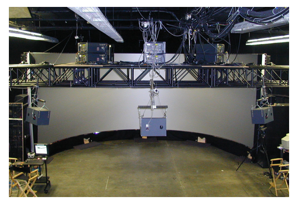
Figure 15 Seamless IPT prototype