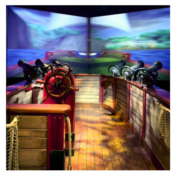
Figure 10 Pirates cannons and steering wheel