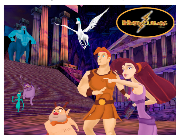
Figure 5 Hercules in the Underworld