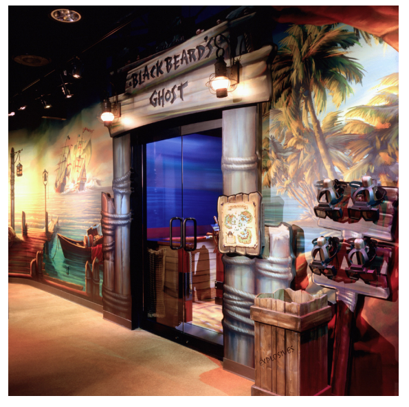
Figure 12 Map and glass entry door of Pirates ride