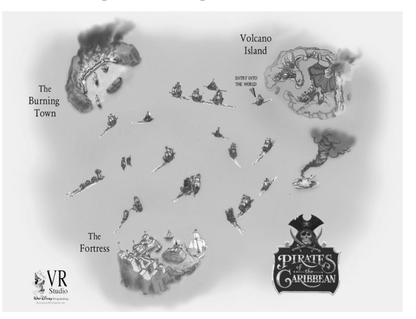
Figure 13 Map of the Pirates world

If these fail to bring the ship to the action, we bring the action to the ship; enemy ships attack from behind, sea monsters rise up from the deep.