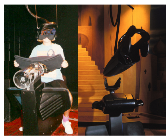
Figure 4 Aladdin ride interface