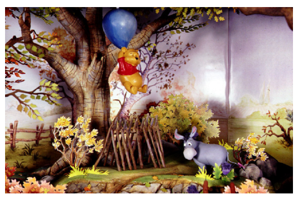
Figure 14 Sample model from Pooh's Hunny Hunt