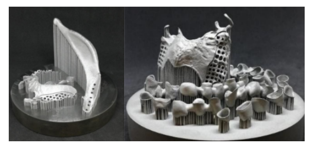
Figure 1: Based on the list of orders and their priorities, the same building platform may be filled differently. On the left, the denture (sheet) is an urget order, hence it is placed horizontally for fast production. On the right, the same part is placed vertically so that more parts can be produced in the same overnight session.

more precise quotes for clients. Since real 3D printing is an extremely slow and expensive process, having an appropriate tool that quickly simulates the process is extremely important.