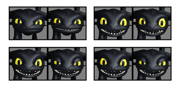
Figure 3: Four examples of the best-matching poses found between two models. In each pair, the pose on the left is generated from a model trained on animations with grumpy-looking animations, and the pose on the right is generated from happy-looking animations.

run the optimization algorithm multiple times with randomly selected initial values to attempt to find the global minimizer. Furthermore, care needs to be taken not to take large steps during the optimization routine because the gradient of the objective function quickly goes to zero as \mathbf{x}_2 moves away from the training points in the model.