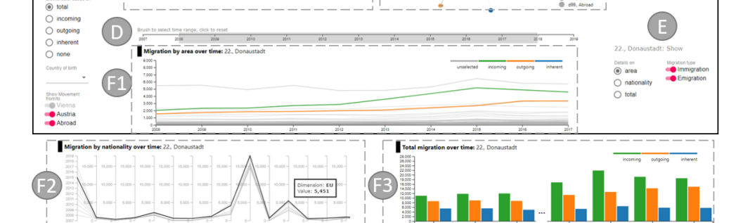
Figure 1: Screenshot of MiFlow (Migration Flow). (A) General Filter. (B) Main Visualization: (B1) Exploration mode and (B2) Analysis mode. (C) Statistics. (D) Timeline. (E) Special Filter. (F) Times Series Data: (F1) Migration by area, (F2) Migration by country of birth, and (F3) Total migration. Each component is described in Section 4.

Andreas Scheidl<sup>1</sup> and Roger A. Leite<sup>1</sup> and Silvia Miksch<sup>1</sup>