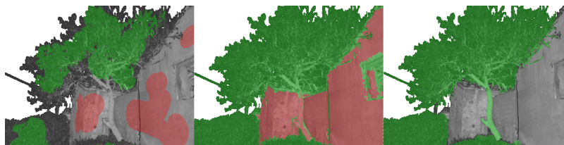
Figure 1: Machine assisted segmentation: 1. labeling regions that need to be differentiated, 2. run the classifier and 3. touch up the result.

1 University of Cape Town, Computer Science Department, South Africa