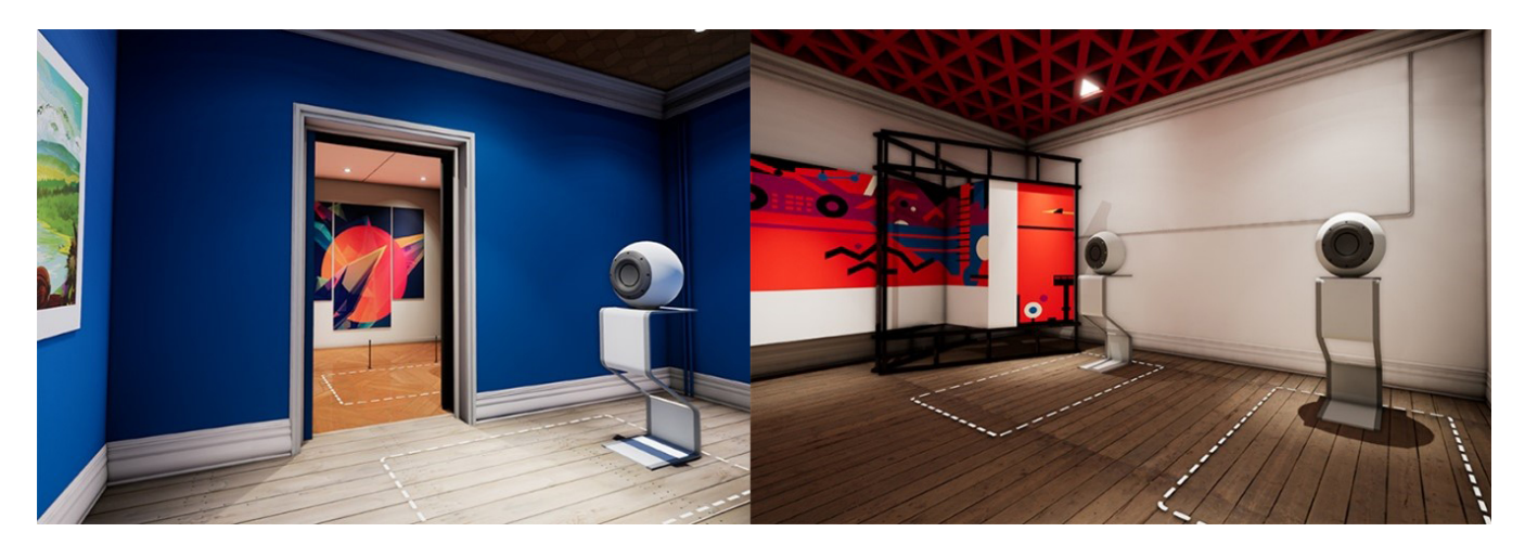
Figure 1: (Left) Image of the two-room (2R) condition. Speaker is on the right of the image and doorway in the centre with view of second room. (Right) Image of one-room (1R) condition. Both speakers are placed within one room