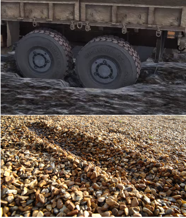
Figure 2: Comparison of tracks left by a vehicle in an interactive application (top), image courtesy of Andres Ørum [Øru15], and tracks left in a natural terrain, notice that the terrain is both compressed and displaced at the side of the track.

pression [Rei10, Øru15], thus ignoring material displacement, see figure 2, or uses multiple overlapping meshes and “push/extrude” primitives to deform the terrain, thus coupling the method with a specific shape and making it difficult to implement and manage, see section “2.c. Mud” of [Zag13].