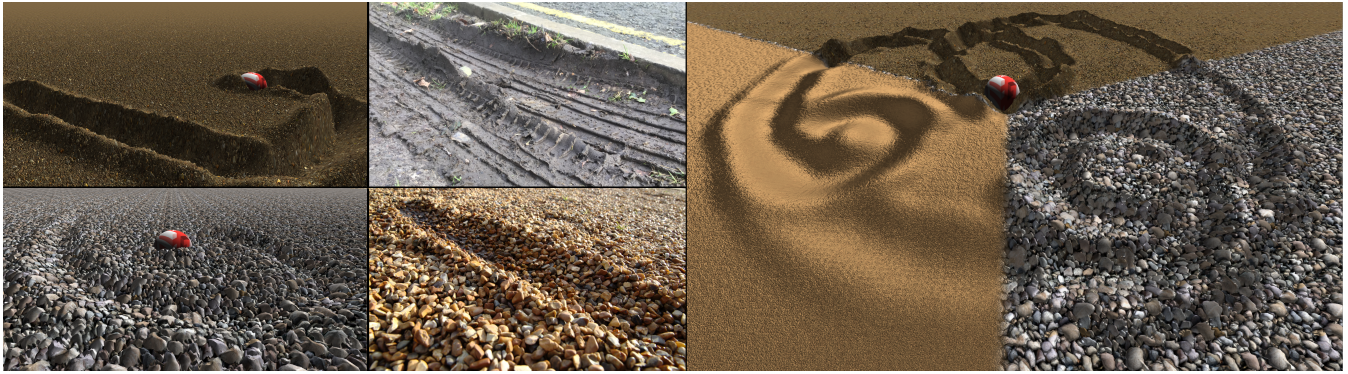
Figure 4: Left: comparison of tracks left on simulated terrains with track left on real terrains, notice that both simulations mimic both the compression of the soil and its displacement to the side of the track. Right: multi-material terrain. Parameters for the materials: Mud: \zeta^{-1} = 6 \times 10^{-4} , \alpha = \frac{2}{5}\pi , D = 0.25 ; Pebbles: \zeta^{-1} = 3 \times 10^{-4} , \alpha = \frac{\pi}{3} , D = 0.9 ; Sand: \zeta^{-1} = 4 \times 10^{-4} , \alpha = \frac{\pi}{4} , D = 1 ;

ber of iteration reduces this problem. Visual comparisons between the simulation's results and tracks on real soil, are shown on the left side of figure 4, show that the method is well suited for applications in video-games and real-time applications.