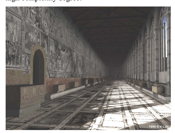
Figure 7: walktrought stillframe of Nord corridor

mere tool designed for professionals of restoration works only to a true ready-to-use Interactive Information System for anyone happening to visit the "Piazza". In order to involve in this project as many laypersons as possible, virtual touristic routes are being carefully studied, paying special attention to their interaction with the system; this with the double aim of simplifying its use and making the multiprojectional navigation possible by using different kinds of control systems. To be able to manage such a remarkable amount of geometricinformative data as well as to allow the greatest freedom in the definition of the user's interface. software libraries have been used which were developed at the PERCRO laboratory of the S.Anna School of Pisa for the part concerning the interactive visualization of Virtual Environments at high complexity degree.