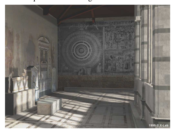
Figure 5: walktrought stillframe of an historical reconstruction

the Camposanto Monumentale held the function of a true museum, used to display the sacred objects from various churches scattered throughout the Pisan area) <sup>3</sup>. In order to achieve this developed specific aim we the system functionalities so as to make the Database-3D model link a dynamic one. As a proof of the many transformations marking the history of this monumental complex, the Information System has been designed to dynamically display - on the user's request - the building settlement in its