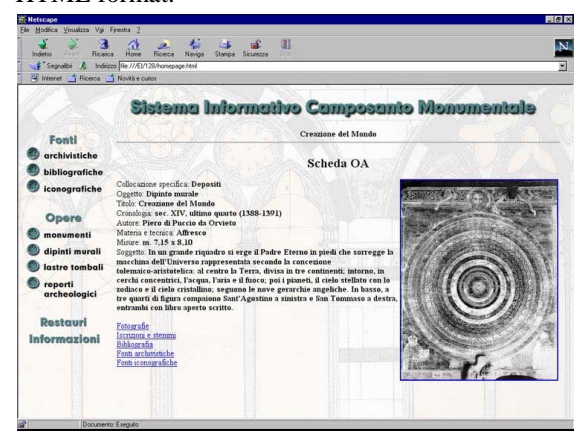
Figure 2: SqlWWW query format its data in HTML.

The studies, projects and then the restoration works themselves produced a multitude of data which could only be interpreted with the help of a computer. This is why an object-oriented Multimedia Database has been designed which can interact with a 3D model of the Camposanto Monumentale, initially conceived to check the repositioning of the frescoes removed from the walls during the war, but able to interact as well with the three-dimensional representation of all the objects in there using the VRML format. The link between the building three-dimensional model which can be navigated in real time - and the Database is achieved through a server created on purpose; this server, named Sql-WWW multithread queries the DB suitably formatting its data in a HTML format.