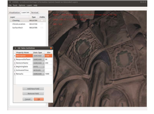
Figure 1: Layer definition on a 3D model from the Honeycomb Ceiling of the Alhambra's Hall of the Kings.

the user can establish a personalized colour map for the information supported by each layer.