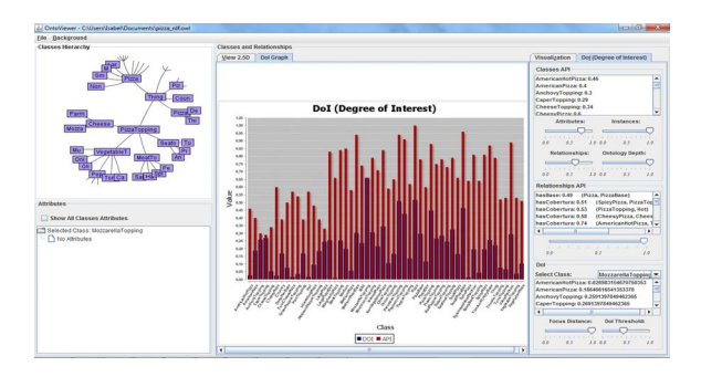
Figure 3: 2D Plot of APIs and DoI values.

The DoI tab (Figure 2 (b)) shows the API values of classes and relationships, and the DoI calculation parameters. These values can be changed through sliders that control the coefficients c_1 \dots c_6 (see Section 3). The interaction with the sliders generates new results that can be analyzed in the lists of this tab and in a 2D plot as shown in Figure 3. The slider DoI threshold allows filtering classes and relationships in the 2.5D view (Figure 4), in order to reduce the complexity of the visualization according to the user task.