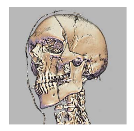
Figure 4: Volume illustration: silhouette and crease edge enhancements with tone shading in a volume dataset [KWTM03].

The use of principal curvature is the most common method of illustrating surface shape. Girshick et al. [GIHL00] cite the psychological basis and geometrical invariance characteristics as compelling arguments for their use. Interrante's illustration of shapes within volume data [Int97] is an early example of the use of principal curvature. [HZ00, RK00, ZISS04] all use curvature as a basis for drawing streamlines.