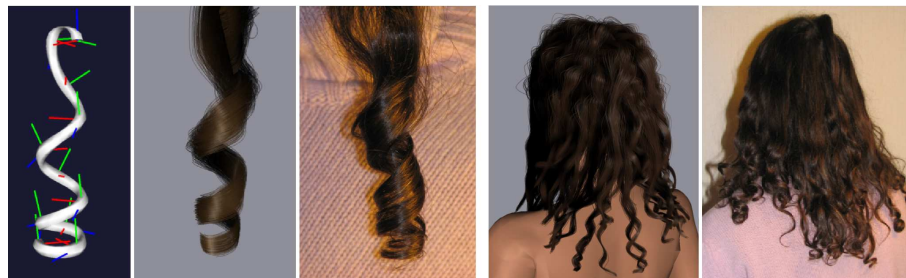
Figure 1: Virtual versus real hair ringlets