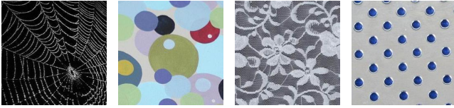
Figure 2: Images used for the retrieval tasks of features evaluation.