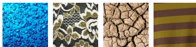
Figure 1: Images used for the retrieval task of methods comparison.