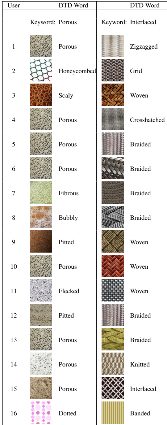
Table 4: Images selected by users in task 2

search for textures in groups according to features of different scales, and our multiscale replication allows them to find the texture in either case. On average, users were inclined to retrieve this image via the features of its blurred version, and the retrieval time in that case is shorter. We believe that this is because the large-scale features are easier to identify starting from an unzoomed view, as is the case in our tool.