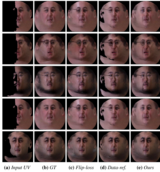
Figure 5: More comparisons of UV completion results on the Multi-PIE UV dataset.