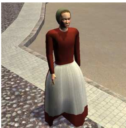
Figure 3: Example of a geometry avatar showing self-shadowing and casting a shadow onto an un-even floor