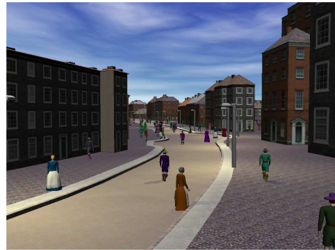
Figure 1: Looking along a street, with many street lights in view

A depth-sorted list of the lights within view is maintained. Due to the spatial coherency of consecutive frames, the overhead of maintaining this list is minimal, as there is no need to recalculate the distance for every light each frame (also as it is only for comparison, distance squared is sufficient). There is the further advantage of drawing in a loosely sorted front to back order, saving on fill-rate by reducing overdraw. In the shadow map construction, the closer the light is to the camera, the higher the precision of the shadow map sub-segment assigned to it.