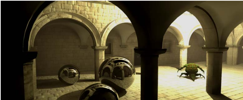
Figure 3: The Sponza Atrium rendered at several frames per second, with diffuse indirect lighting.

of 60k points was used. This set captures the indirect illumination well; for soft shadows, a larger set of 112k points was used to capture the higher frequency details near occluders with acceptable fidelity. Query times for 60k or 110k points are comparable, but obviously, updating the larger set for dynamic lights takes longer.