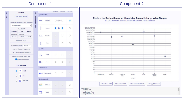
Figure 1: Our tool OMVis for the interactive exploration of the design space.

Scale Bar Charts (WSB), using position Y for mantissa and color plus width for the exponent. Braun et al. [BES*22] used color in their Order of Magnitude Color (OMC) scheme to map exponents to hue and mantissa to a color scale. Focusing on large-scale time-series, Braun et al. [BBSvL24] introduced Order of Magnitude Horizon Graph (OMH) and Line chart (OML), with OMH using position Y for mantissa and color intensity for exponents, and OML combining SSB’s position with OMC’s color scheme.