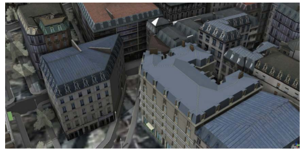
Figure 2: City model generated from municipal GIS

The last step takes on the responsibility of procedurally generating the models for the urban environment. The Esri CityEngine ® software was used in this study (see figure 2).