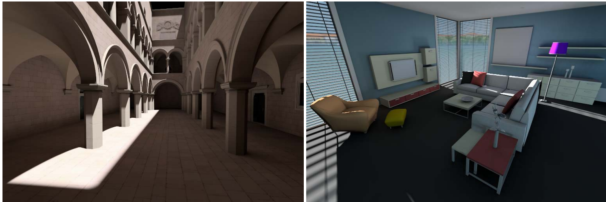
Figure 2: Left: The SPONZA scene rendered with about 4 times fewer VPLs than when using standard VPL sampling. Right: The LIVING ROOM scene. 77% of the VPL candidates get discarded by our algorithm.

An interesting effect that we observed in our tests is how the image brightness and its inversely proportional acceptance probability (see Equation 3) accommodate over time. As the total VPL illumination luminance estimate varies from frame to frame, p_i is automatically adjusted to compensate for the changes. As a result, the total brightness converges quicker than when using standard VPL sampling.