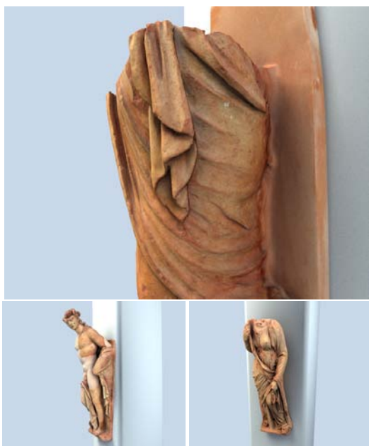
Figure 5: Three frames of the short movie generated from the digital models. All the frames comes from the sequences that shows the details on each statue

The color used in the short is the one that has been produced with the photographic mapping, as described in the previous section. Regarding the surface material representation, the rough diffuse nature of the terracotta has been well simulated using an Oren-Nayar shading. The properties of the material has been hand-tuned in order to obtain a result that closely matched. Accurate measurements of the surface response have been considered, but we found it excessive for this kind of presentation.