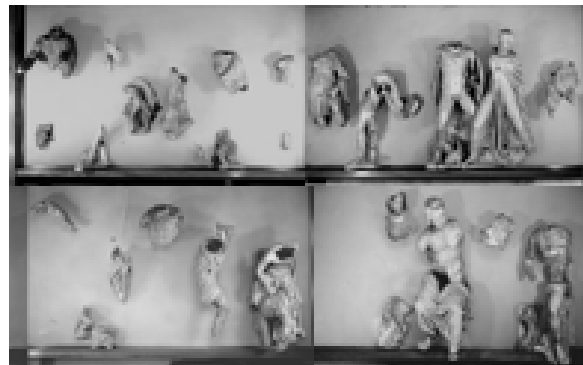
Figure 2: The "Frontone B" group of terracotta from the Luni Temple, according to the old presentation in the National Archeological Museum in Florence (status before the 1966 flood).

resolutions. Then groups of images were registered to the models [FDG*05] so that the color information could be projected on the geometry [CCCS08]. Screenshots of the post-processing work are shown in Figure 4.