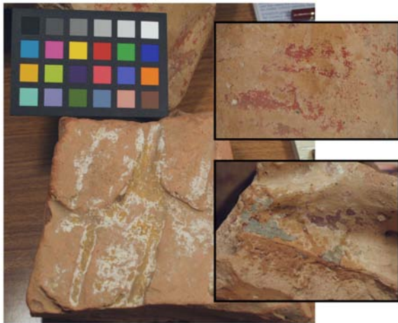
Figure 6: Main image: an example of one calibrated images of the color samples, in this case, the yellow color used for Apollon hairs. In the Insets: examples of other colors, dark male skin (upper) and grey-green used for vests and background elements(lower)

ongoing: we are trying the different measured shades of the colors and paint areas in order to better match the original color description and similar painted examples in literature. Beside this first objective of re-applying the original color, we are also trying to assess the effectiveness of the Mesh-Lab Paint interface. We hope that we will be able to improve the painting interface through the interaction with people with a cultural heritage background. Subsequently, if the first results are convincing and when a larger color palette has been obtained by measuring color remains, we will start applying a more complex shading, trying to use painted highlights and shadows in order to accentuate the geometry.