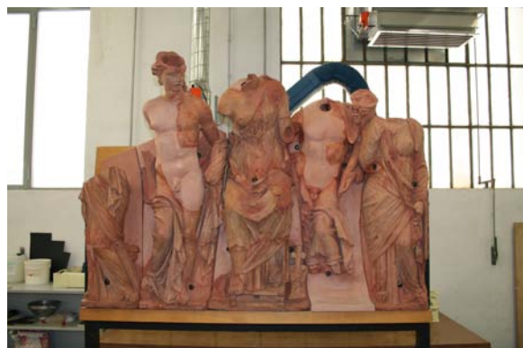
Figure 3: The five acquired statues of the “Frontone A” group, displayed in the proposed disposition hypothesis