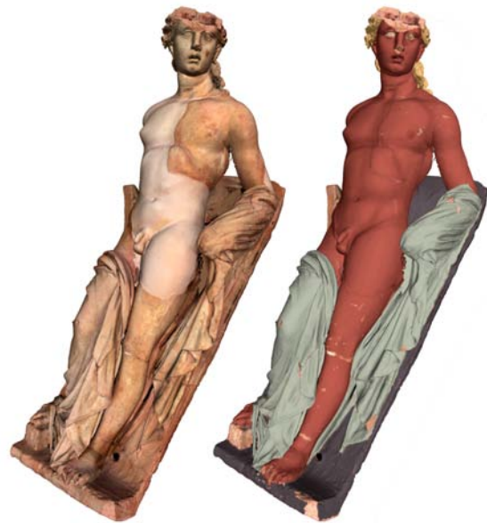
Figure 7: On left: the model of the Apollon statue with its actual color. On right: one of the first results in the reconstruction of the statue original coloring

The digital model will also enable the museum curators to build very accurate copies of the digitized objects. An interesting, but sometimes underestimated feature, is the possibility to make accurate reproduction at any scale. The full scale reconstruction will be used for the already planned placements of a copy of the second group in the original archaeological location. However, also the scaled models could be