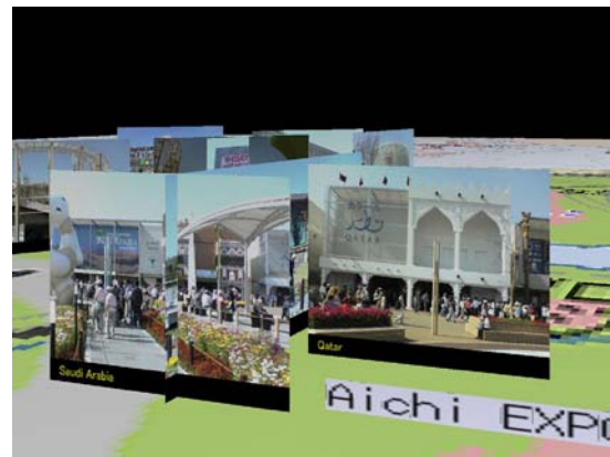
Figure 2: Virtual world constructed using the transmitted pictures from the Expo site.

After the experiment, the subject recounted to us his impression that he could clearly memorize spatial relationships that had not been obtained during the real experience by reliving it in the immersive virtual world. Moreover, the information in the constructed virtual world was more and more enriched when several subjects performed the experimental task. Therefore, the hybrid information space was also useful for the user who experienced the virtual world before visiting the actual Expo, since he was able to gain prior knowledge or acquire a mental map of the Expo site.