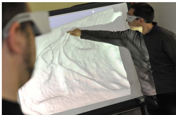
Figure 5: Presentation of the engravings of the bâton percé to the general audience.

A simple trigger of the button on the back of the Wiimote freezes the virtual object, allowing the user to control whether he wants to enable or disable the manipulation of the 3D model. This makes it very intuitive to reposition the hand in order to continue to manipulate the virtual object to make, for example, a complete turn. We have already prepared the application for the manipulation of two pieces as in [RRS*07] with 2 Wiimotes.