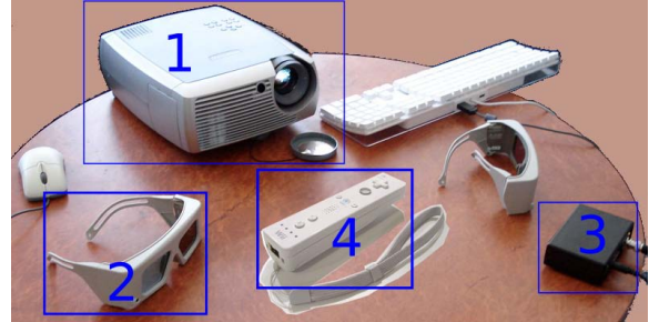
Figure 3: Details of the hardware used for visualizing and interacting with the bâton percé: 1. DepthQ 3D projector for active stereoscopic projection; 2. NuVision 60 GX stereoscopic wireless glasses; 3. infra-red emitter for synchronization with the glasses; 4. Wiimote wireless device.

powerful configuration with an easy setup at a quite affordable cost.