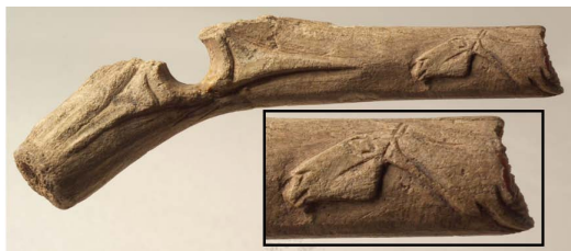
Figure 1: Photography of the bâton percé with a zoom on the engravings.

Toulouse Natural History Museum. Among the numerous objects which were discovered in La Madeleine, many specimens of portable art were studied by researchers in Prehistory. During the renovation of the Toulouse Museum, an inventory of Lartet’s collection enabled us to recover a broken bâton percé from La Madeleine. This bâton consists in a 10 cm long, decorated cylinder of reindeer antler with a hole through the thickest part and engravings representing the head of a horse (see Fig. 1). An examination of the other objects collected by Lartet led to the conclusion that the specimen from Toulouse is the complement of another fragment stored in Saint-Germain-en Laye. There is no record of the discovery so we do not know precisely in which stratigraphic level this stick was collected. However, the style of the engraving suggests Upper Magdalenian, around 12,000 B.P.