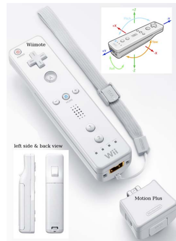
Figure 4: The Wiimote device with the Wii Motion Plus.

A key point for using such data is to have a convenient interaction with the virtual model. The idea is to use a tangible “metaphor” of the object in order that the user will use it naturally and then, forget it very quickly, being focused on the image projected on the screen.