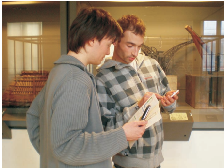
Figure 2: Quest-solving using a museum map and the two delivery platforms used for the game UPN

the same time valuable feedback was collected concerning aspects of the interface and interaction design, both of which underwent several changes in between the first and the fourth demonstration sessions. For example, it was found out that the interface design did not convey for all visitors the fact that all of the objects to be discovered were related with one main TO. Another preoccupation was to see whether the participating visitors would manage to work collaboratively as well as whether they would be able to appropriately use both of the necessary mobile devices (the NFC-enabled mobile phone for reading the content of the RFID tags and the I-Phone for receiving the hints related with the TO and the IOs, Fig. 2). For the majority of the players, the rules seemed to be explicit enough while the game design provided a fast learning curve.