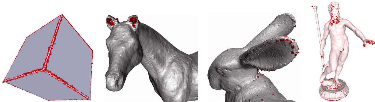
Figure 2: Implicit SOM reconstructions. The detected feature points are drawn in red.