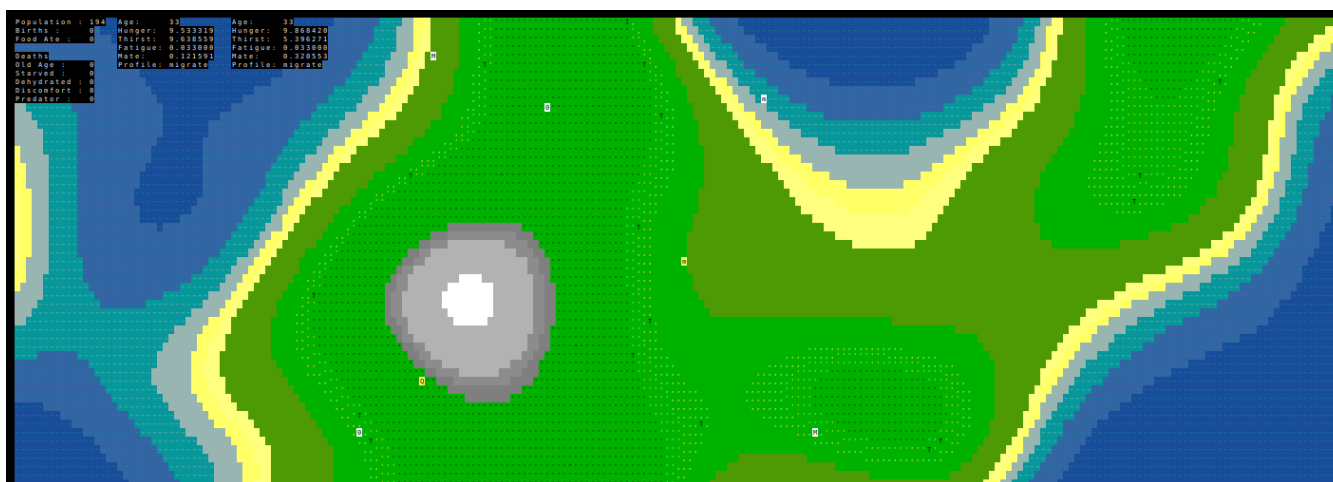
Figure 1: Visual output of the program, showing the environment populated with a variety of agents.