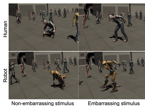
Figure 1: Example of stimuli. Top row is human, and bottom row is robot. Left is non-embarrassing and right is embarrassing stimuli.

4 situations (walking in town, walkthrough a door, dance in an open space, classroom) both for embarrassing and non-embarrassing conditions. For example, a person or robot is walking, then picks up something (non-embarrassing) or stumbles (embarrassing) in a crowd of people (Figure 1). An embarrassing or non-embarrassing event occurred at 15-17 s after the trial started, and the total duration of each trial was 35 s.