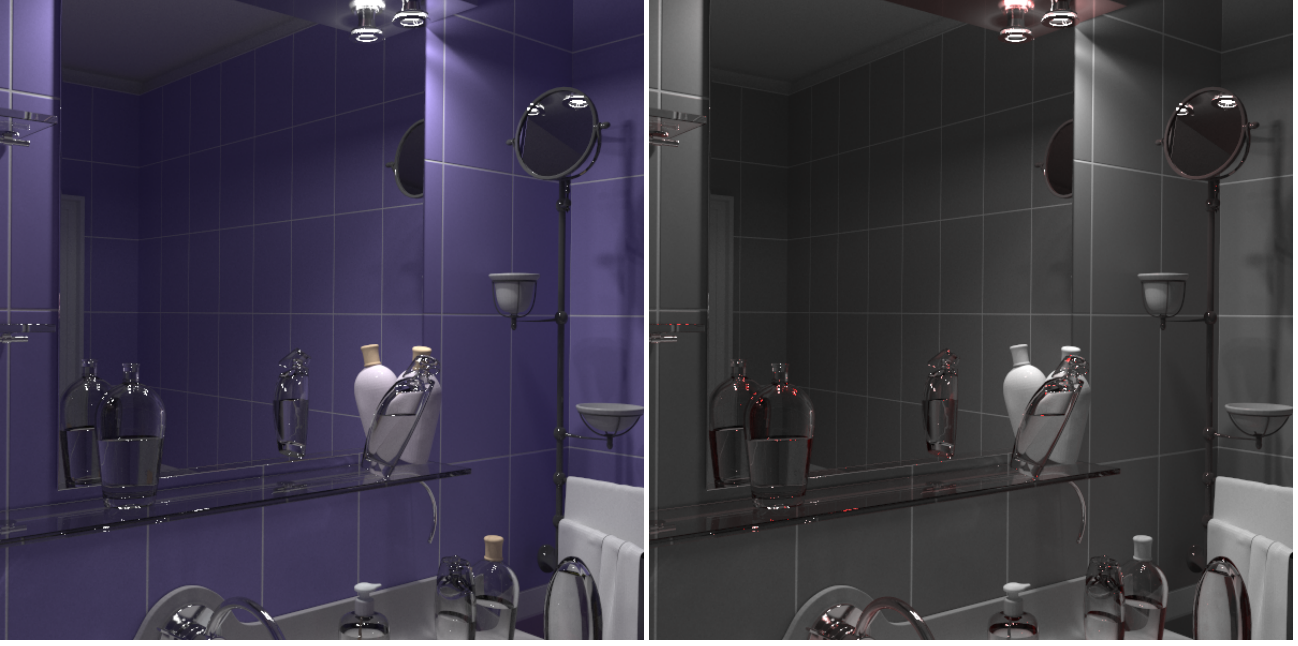
Figure 3: Bathroom scene. Left: intensity of the computed light, right: degree of polarisation overlaid over a grayscale image

the 12th Eurographics Workshop on Rendering Techniques, London, UK, June 25-27, 2001 (2001), Gortler S. J., Myszkowski K., (Eds.), Springer, pp. 197–204. 2