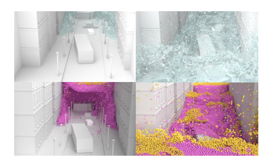
Figure 3: A fluid block flooding the street. The rendering results are displayed as fluid surfaces and clustered particles.