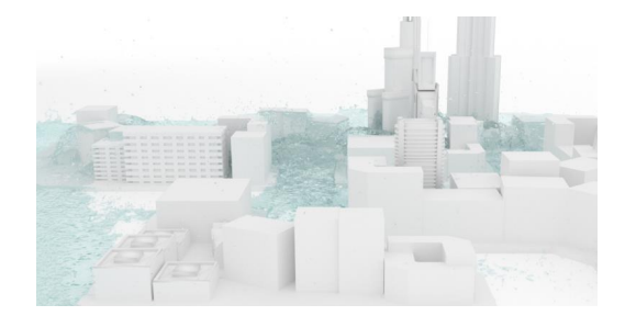
Figure 4: City blocks with flooding.