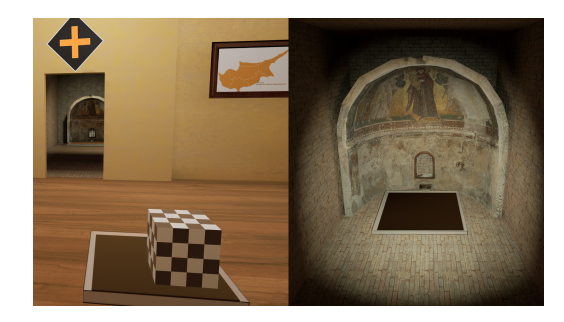
Figure 2: Inserting a resized cube into a trigger box unlocks a hidden room showcasing the famous 6th-century wall mosaic in Aggeloktisti.

The difficulty of the game is increased as the player progresses through the rooms. This is implemented by introducing new and combinations of challenges, riddles are harder to solve, challenges require multiple tasks to be completed, and less clues are provided to the players. The key game mechanics were developed by the second author of this paper as part of the requirements for his undergraduate degree final year project, under the supervision and guidance from the first author.