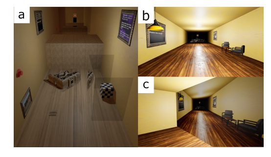
Figure 4: Gravity (a) and deception (b, c) optical illusions.

To design the DCH aspect of the environment, several important archaeological artefacts have been digitised. A team of undergraduate students studying Computer Games Development at UCLan Cyprus, under the guidance of the lead author of this paper have visited, captured and digitised them to develop a game that will aim to bring them all into a single interactive VR experience. The game currently features the church of Panayia Aggeloktisti including its unique 6th century mosaic (Figures 1 and 2) and wooden paintings, the church of Prophet Elias (Figure 3), and the ruins of Aghios Mamas church in Aghios Sozomenos deserted village among other exhibits (Figure 4a). Data was captured using drones equipped with high-definition cameras, high-quality digital