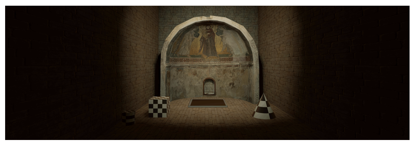
Figure 1: A view of a hidden room featuring the 6th century mosaic of Panayia Aggeloktisti church

<sup>1</sup>School of Sciences, University of Central Lancashire, Cyprus