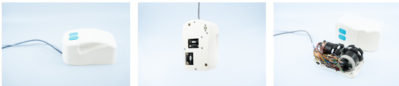
Figure 1: The CASTOR mouse with its two omni-wheels protruding from the bottom and the BLDC motors inside the shell.

cantly differently from regular mice. One early example exists of an unanchored mouse [AS94], that provides friction through an electromagnet inside the mouse and a solenoid to prod the user’s finger. Since then, some advancements have been made, first by Kudo et al. [KSK07] who created an unanchored 2dof ball mouse with force feedback, and later Kianzad and MacLean [KM18] who created a similarly functioning, miniaturised mechanism in a pen-like device.