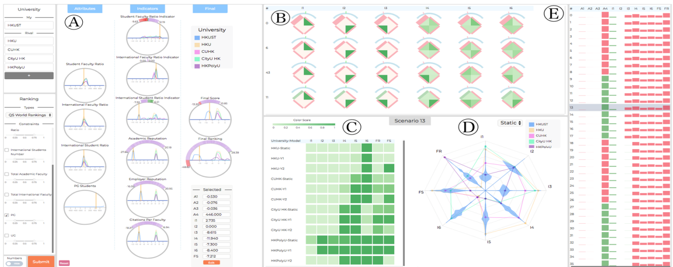
Figure 1: The user interface showing multiple rival universities, where Scenario 13 is selected for further analysis. (A) the Scenario Analysis View, (B) the Relationship View where 4 scenarios have been selected for comparison, (C) the Rival Heat Map View, (D) the Rival Radar Chart View, (E) the Scenario List View.