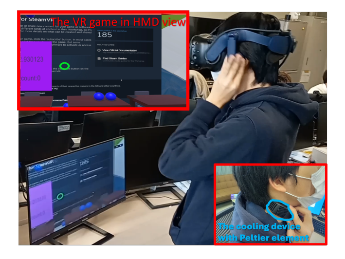
Figure 1: Experimental apparatus, VR game in HMD view, cooling apparatus and the cooling device

Various studies have been conducted to alleviate VR sickness. The main factors that cause VR sickness are sensory mismatch, insufficient display resolution, latency, improper interpupillary distance setting, and visual field. Many studies that attempt to treat VR sickness address these factors by removing or reducing them. In addition, as methods that do not directly address the aforementioned factors, research is being conducted on displaying a virtual nose in