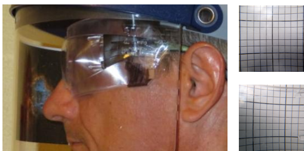
Figure 3: Left: Fresnel glasses with a head-mounted image plane (left eye image removed for clarity). Right: Views to front and 65° to the side.

widest angle) taken from the eye position through the Fresnel lens towards directly front and with the camera rotated 65° to the side. The resolution is preserved well in all directions.