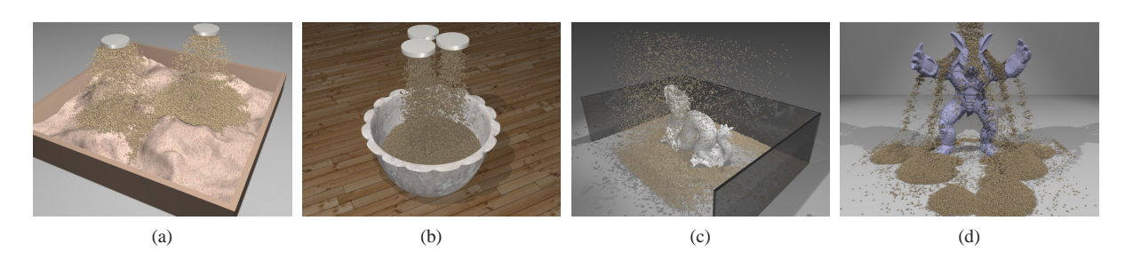
Figure 4: (a)Sand grains are splashed onto an irregular terrain. (b)Sand grains are poured into a bowl. (c)Sand grains are splashed and halted by the dragon and the glass wall. (d)Sand grains are poured onto the armadillo.