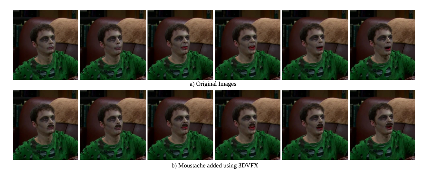
Figure 5: Adding a moustache on Sheldon's face using 3DVFX.