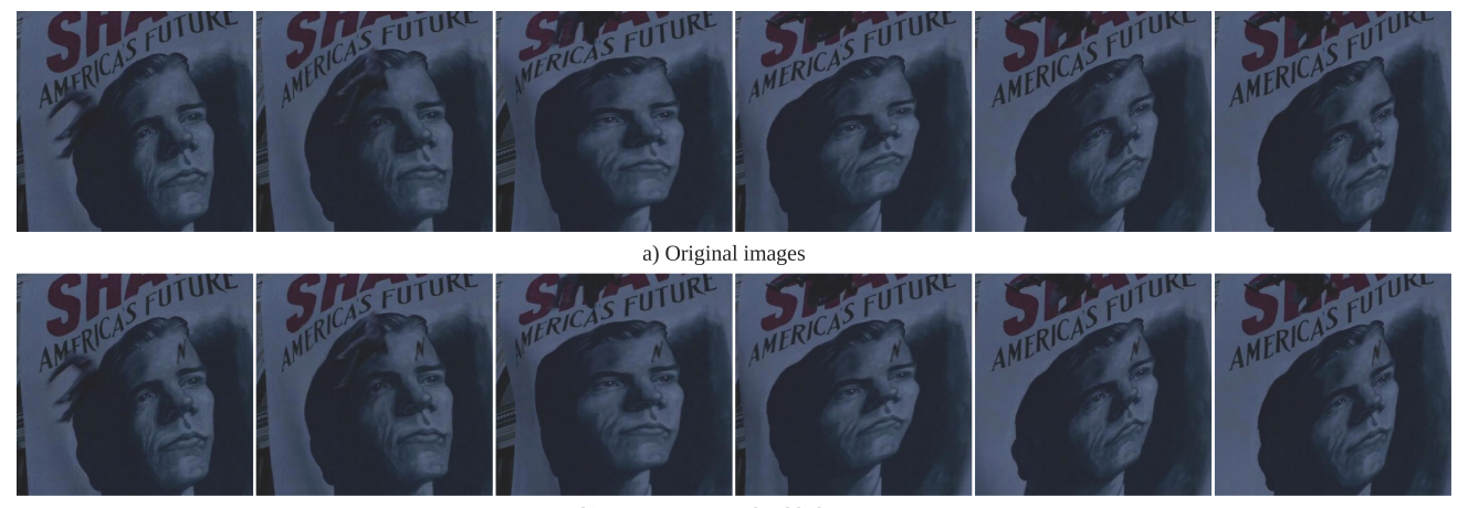
b) Harry Potter mark added using 3DVFX