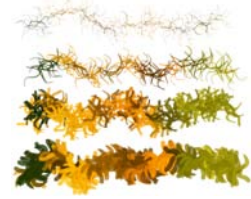
Figure 3: Strokes can be sketched with pen, one finger, two fingers, fist (left side). Strokes are rendered to texture and distributed with the one finger posture (shown on the right side) or the fist posture (this would produce more strokes within a larger region). The different colors of the strokes on the left side are derived from the underlying color image.