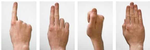
Figure 2: Hand postures: 1 finger, 2 fingers, fist, and hand.

In distribution mode, however, the two finger posture is