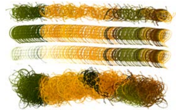
Figure 4: A sketched stroke (left) is first distributed with one finger, aligned with two fingers, faded with the hand, and redistributed with the fist posture (right, from top to bottom).

mapped to stroke alignment which can be used to organize strokes once they have been applied, for instance to emphasize certain structures in the image. While automatic alignments could certainly be derived, e. g., from image edges or gradients [Her03], our interactive alignment allows exploration of stroke alignment, providing more flexibly and creative freedom. Predominantly linear features can easily be created by sketching a stroke in alignment direction, distributing it on the canvas, and finally using the alignment posture. Here the two fingers of the posture serve as a natural indication of the alignment direction.