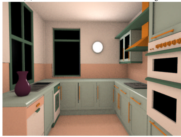
(c.) Without mirroring surfaces. 355 secs. rendering.