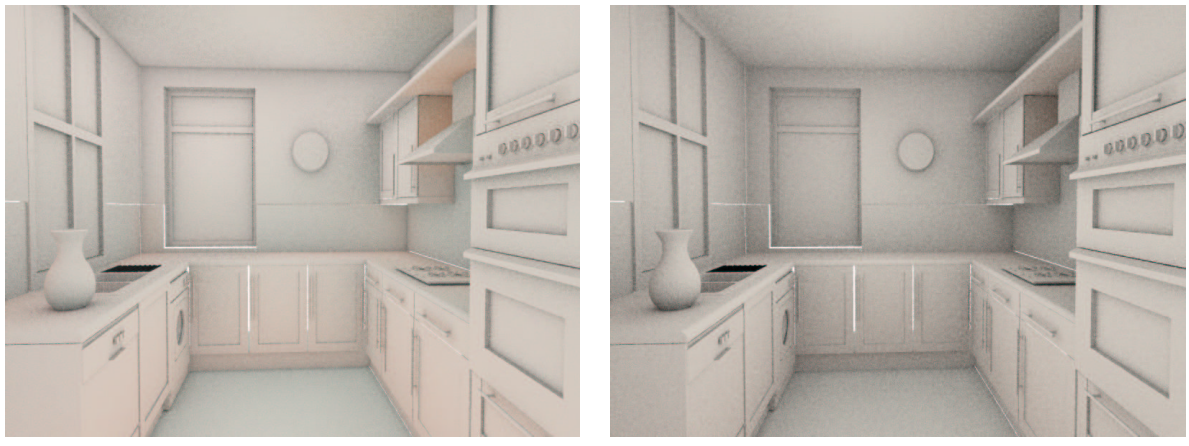
(a.) Square root function