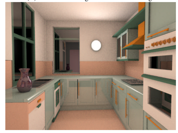
(d.) Final image with every feature included. 527 secs. rendering.

Figure 2: These four images demonstrate the contribution that each of the features of our rendering algorithm give to the final image. All the images of the kitchen scene shown here have a resolution of 800x600 pixels.