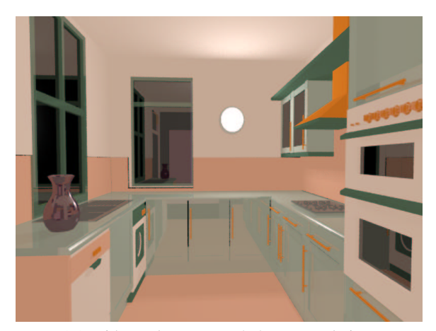
(a.) Without obscurances. 260 secs. rendering.