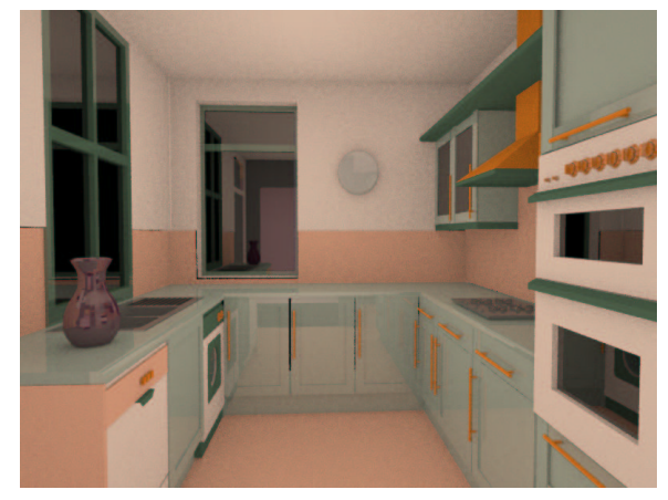
(b.) Without direct light. 396 secs. rendering.