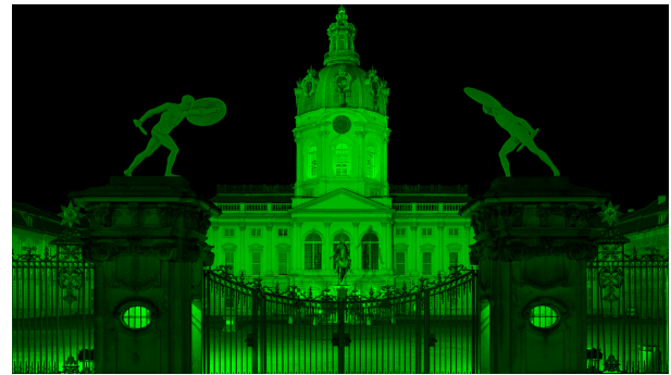
Figure 1: Image from which the distorted holograms were generated, selected from the Div2K dataset as the image with the greatest distribution of black pixels.

To the authors' knowledge this would be the first published work on JND within CGH. The aim of this research is to determine the JND of dead pixels on an SLM used to generate monochromatic,