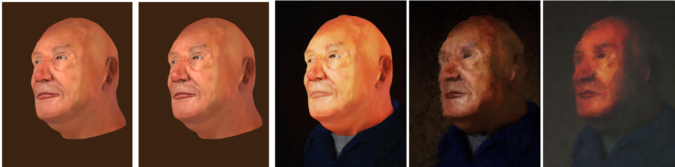
(a) Rendering with only diffuse rendering. (b) Rendering with diffuse and specular reflection.