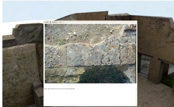
Figure 1. Data visualization through the virtual model in the Scenario House of the Skeleton

The ViSMan-DHER application allows free navigation into the House model, the creation of view-points, ground- and wall-collision detection, and of course queries and visualization of connected data.