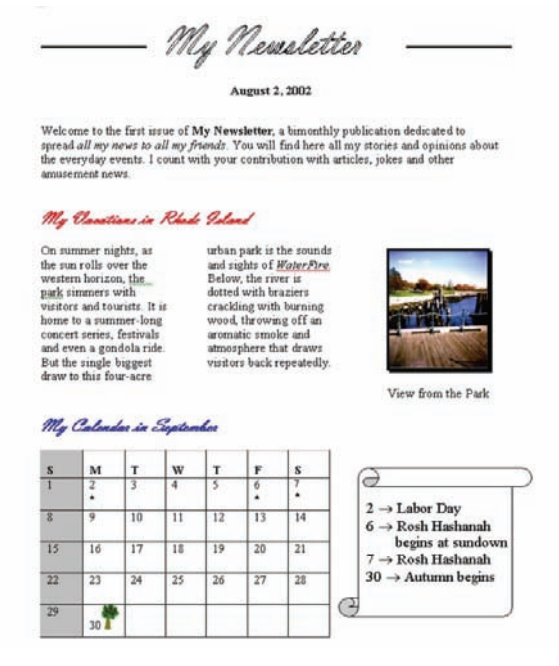
Figure 1: Word processing task.

each eyebrow downward. The frontalis brings the eyebrows upward. The zygomatic muscles control movements of the mouth and produce expressions like smiles.