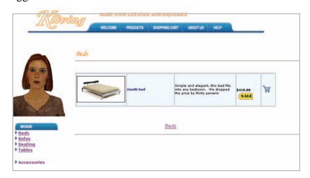
Figure 5: Furniture shopping website.

The female character was created using Haptek Inc.'s People Putty [HAP05]. The social agent speaks about the items in a similar manner to an actual shopping assistant. Although much of the product information is available as text, she offers supplementary information and occasionally makes suggestions.