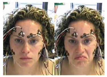
Figure 2. Example of a facial expression portrayed by the participants.

The EMG signal was collected at 1000 Hz. A video camera recorded the subjects' faces and the screen was video captured during the period the subjects worked on this activity. In the design of the experiment, among the employable methods to gain insight into the subjects' assessment of the task, the "think-aloud" approach was set aside since the subjects' conversation would have interfered with the EMG data collection.